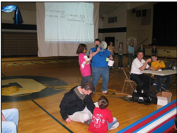
Raffle and FASCAR Race Brackets