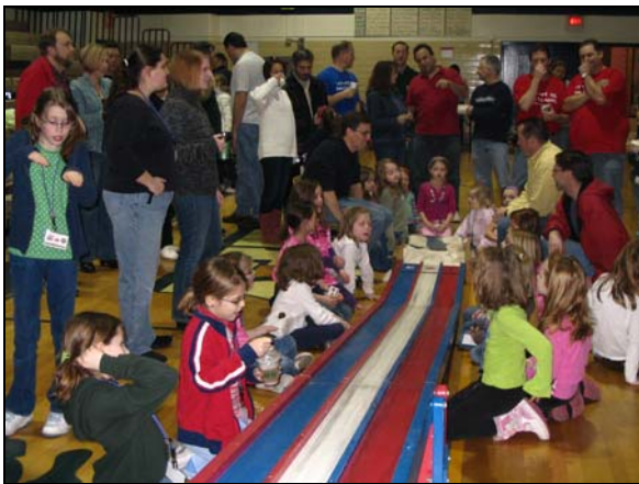
Powder Puff Race Fans!

Another fun Race. Copley Middle School Gym was abuzz with activity on Saturday morning, March 1, 2008. Two by two the cars raced down the wooden track. In the end, some took home trophies but all enjoyed the experience with friends and family. The refreshments raffle and side games were fun too. The raffle, which also ran through the boys race, raised a good portion of funds to purchase a new track. Maybe we can obtain a new track by next year.