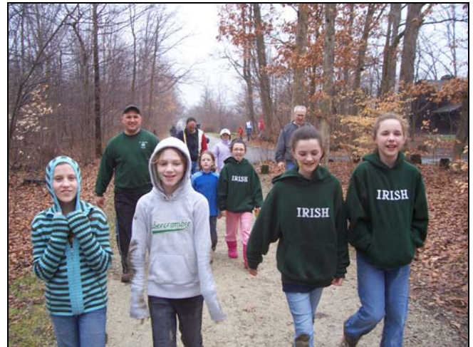
Adventure Day 2007